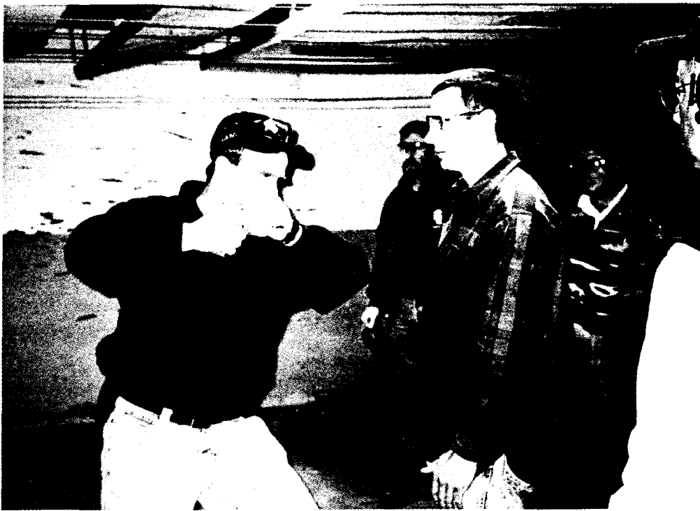
Cooley discusses the fundamentals of the "barrel strike."

there admiring your handiwork feeling his knife slam between your ribs. Disarming someone reduces their options for attacking, but never ignore the fact that unless physically restrained they are still capable of aggressive actions.