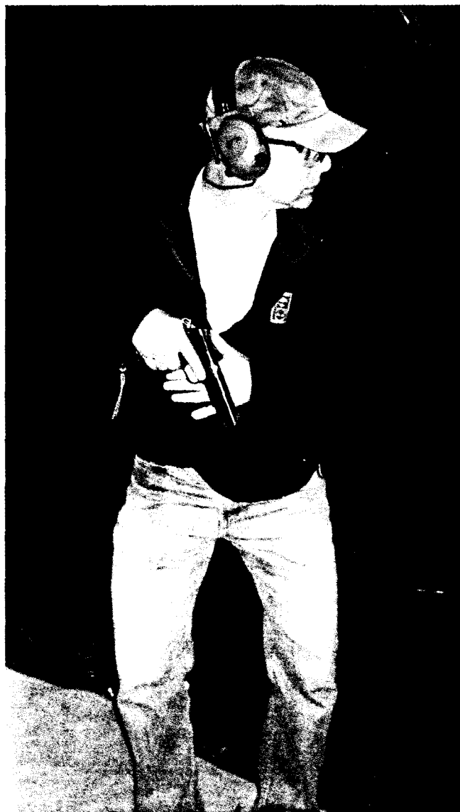
The author utilizes the "Sul" ready position during a building clearing exercise.

Simply displaying your firearm and issuing verbal commands diffuses some incidents. Another altercation may require you to employ non-lethal physical actions. Then there are confrontations where survival demands the immediate use of deadly force. An armed individual, civilian or professional, must be capable of instantly assessing a situation, determining the level of force required and applying the appropriate techniques.